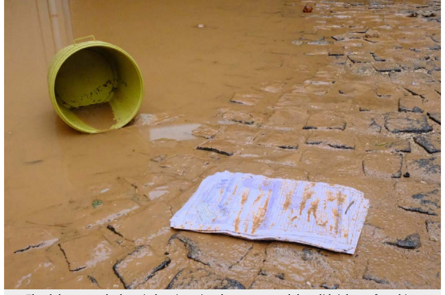
Flood threw out the hospital registration documents and they didn't let us for taking photos and videos.