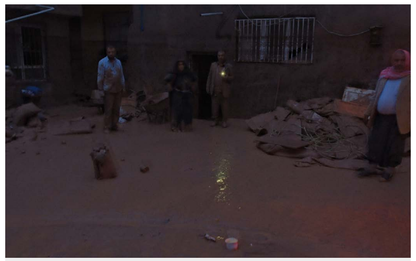
The victims of the flooding were Arabics, Kurdish, and Turkish. Some of them with a political stance said we consent with the government and add disaster is big but this case is normal.