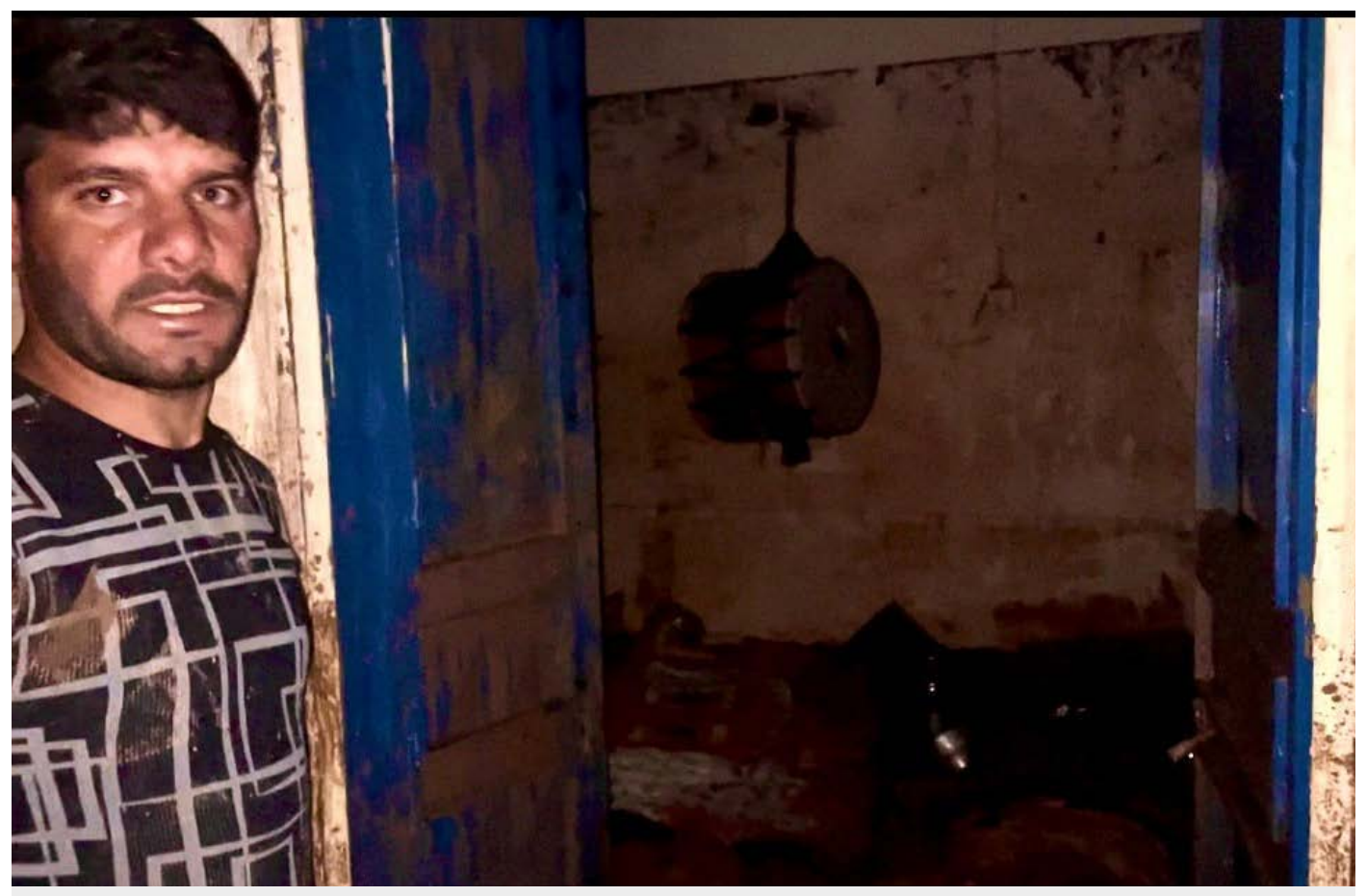
Most of the victims of the flooding were Eyubi and Halili that both of them is in the center of the Sanliurfa.