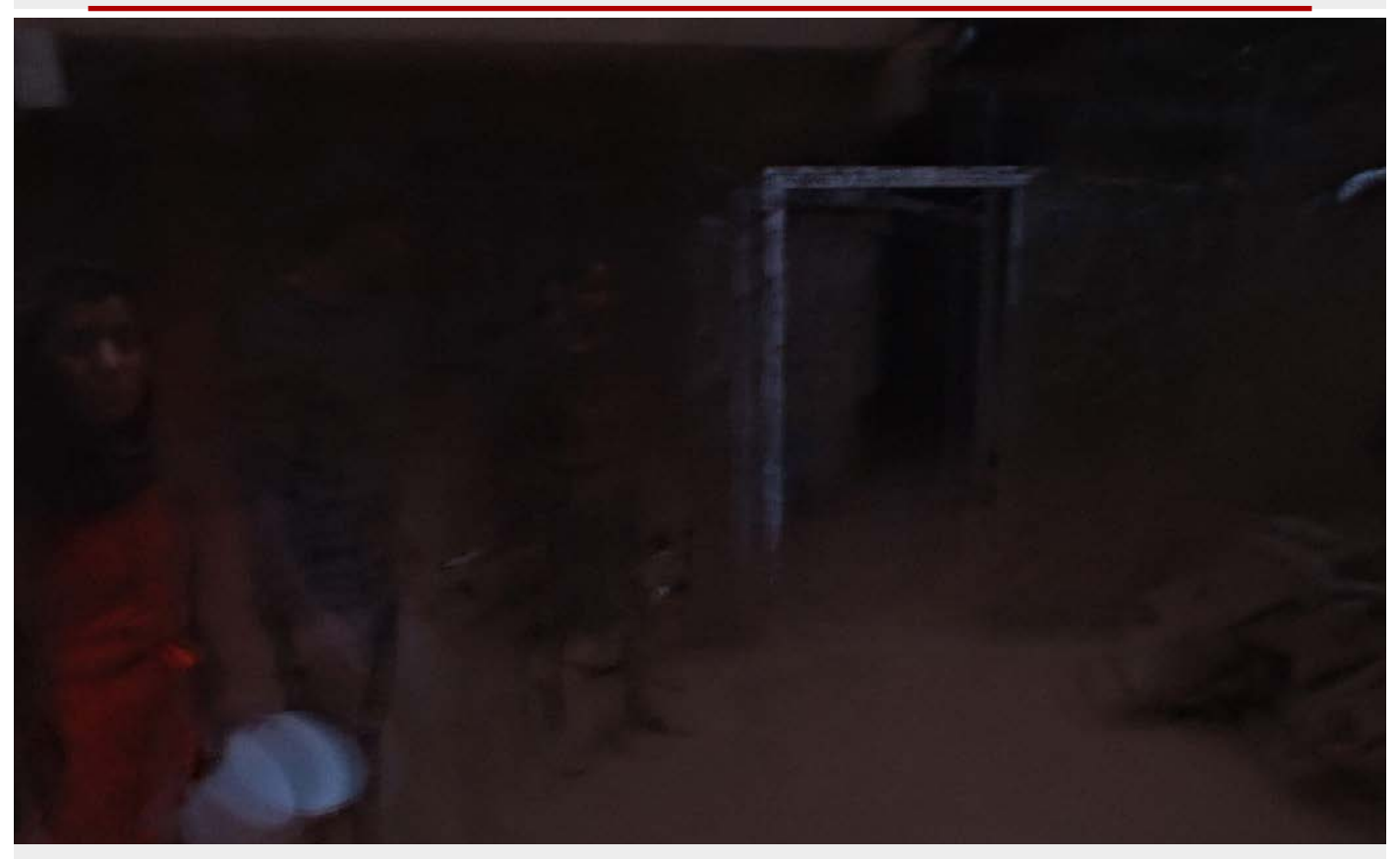
Also, some of them say that it is evening, and there is neither electricity nor a lighthouse. We have been calling since morning but nobody comes to rescue us, we are in the darkness.