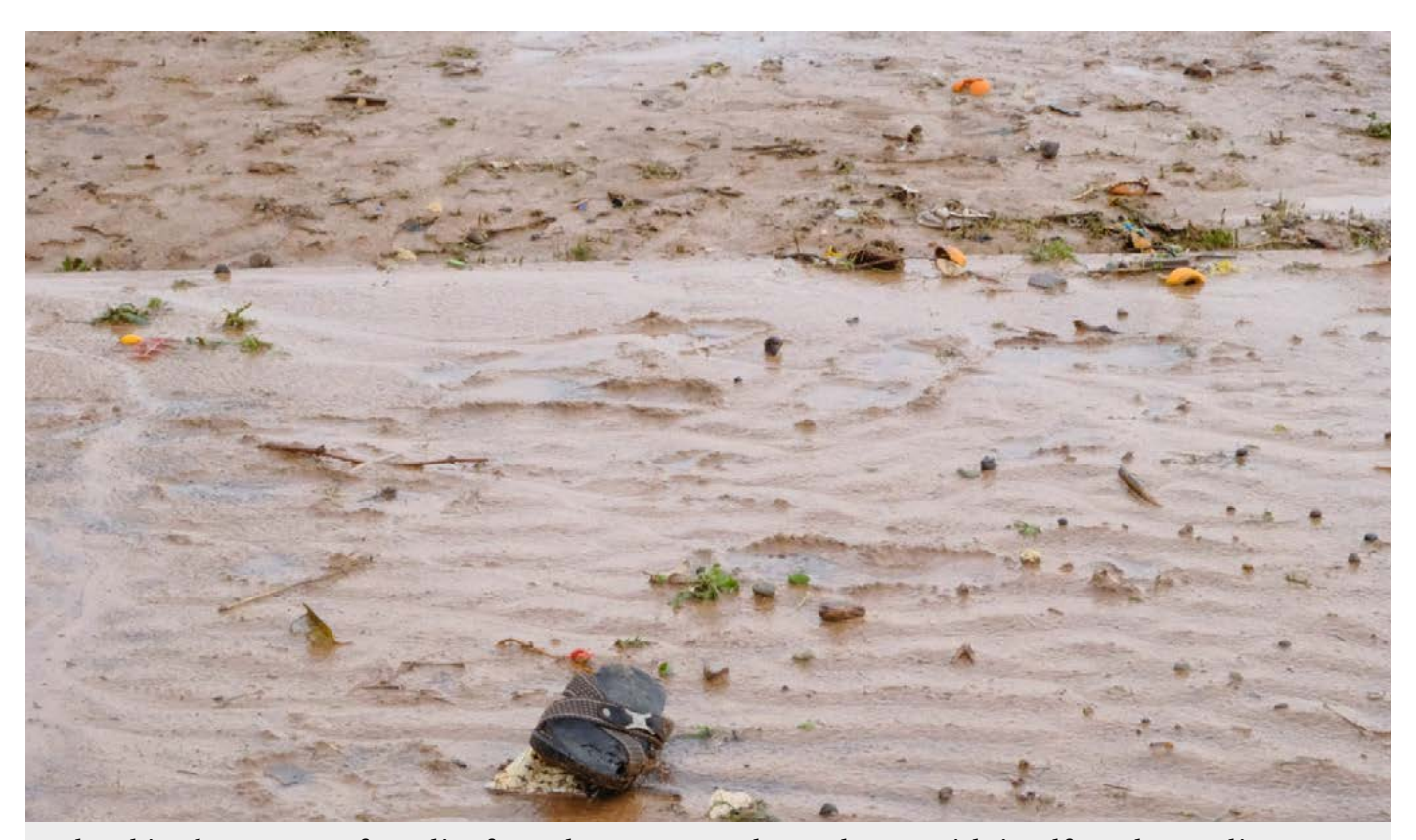
Flood in the center of Sanliurfa took trees, people, and cars with itself, and one slipper on the pile of water.