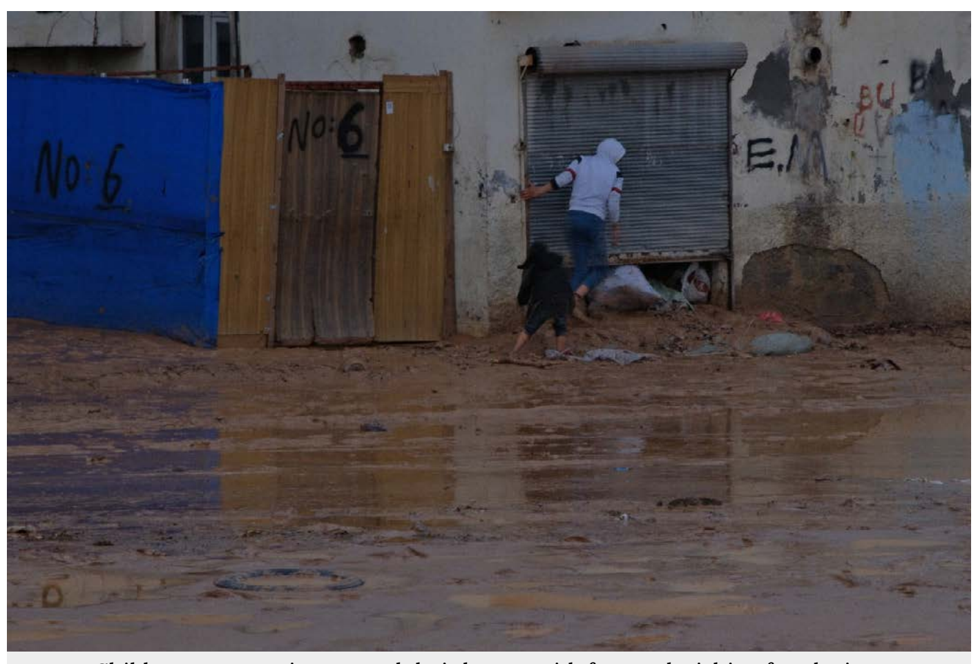
Children were staying around their house, with fear and wishing for playing.