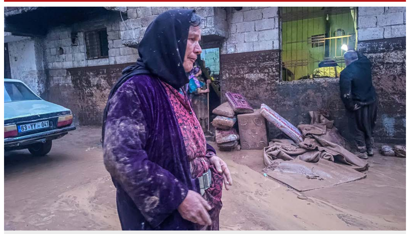
Sanliurfa came across flooding in the morning on the 15th of March after the earthquake on the 6th of February. At first, Tiktok videos and sharing on social media showed the world how it is big. Official sources piled up one by one the number of deaths and towards evening this number passed ten.

⊳ 🔼 Omer Faruk Baran 🔇 Yonca Sarsilmaz 🛗 1<u>5</u>. 03.2023