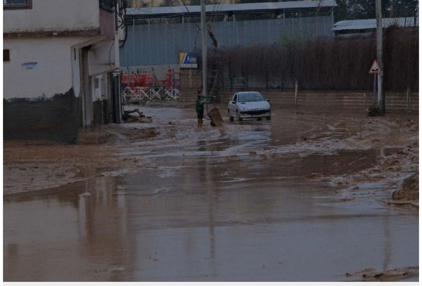
One of the children drained the water from the house and spilled it on the street.